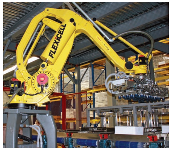
A robot picks up cases with a patented gripper that uses an array of vacuum cups and places them on a pallet.

The corrugated cases are printed and erected offline by an Iconotech flat-case digital printer followed by a Pearson Packaging Systems Model CE25-T erector that tapes the bottom of the cases. The cases are then conveyed to the robotic