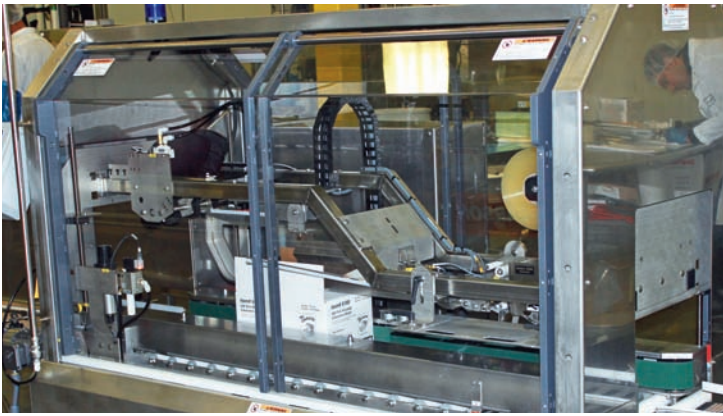
Machine applies tape to tops of cases of IQF vegetables.

have separate servo motors for the auto-synchronized up/down and open/close motions. The bag length and sealing jaw pressure are electronically measured and adjustable.