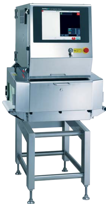
Anritsu KD7416 X-ray system.

“The Ilapak bagger and Yamato scale can run 15 bags/min faster than any other equipment on the market, and the Adept robot is the fastest pick-and-place robot available. All of the other robots that we looked at would have required two robots on each line. Adept does it with a single robot.”