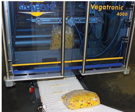
Vf/f/s machine runs 140 bags of IQF vegetables per min.

processing area in bins to each line, and a vertical bucket elevator lifts it to the scale platform. The elevator discharges into a vibratory feeder that discharges into the vibrating top cone of the Yamato weighing system. The elevator and vibratory feeder were supplied by Deamco Corp. Ltd. A programmable load cell under the center cone turns the product discharge on and off to maintain the proper product level on the cone.