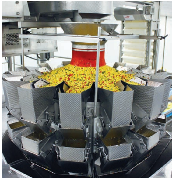
Radial weighing system features 14 weighing stations that achieve an accuracy of +/-1 to 1.5 g.