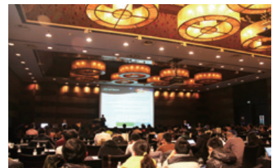
LTE and LTE-A Measurement Technology Seminar in China

Anritsu has been developing businesses closely aligned with the information and communications industry in China. To further strengthen our efforts on TDD-based LTE, on December 6, only days after obtaining our license, we co-sponsored the “LTE and LTE-A Measurement Technology Seminar” with the TD Industry Association (TDIA), an organization that promotes TD technology in China. The seminar was attended by 135 participants, including leading figures in China’s mobile services industry and reporters from the media. We gave a presentation on the latest LTE and LTE-Advanced measurement technology and set up an exhibit to demonstrate the instruments.