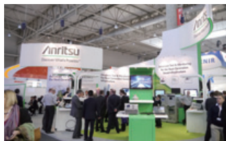
Mobile World Congress 2014

At the Mobile World Congress 2014 in Barcelona, Spain, the world’s largest tradeshow for wireless communication, we exhibited our latest LTE measurement solutions that are contributing to the popularity of mobile broadband services. The solutions and technologies we showcased encompass the entire spectrum, from the development and manufacturing of mobile devices to base stations and monitoring. We also demonstrated LTE-Advanced at a well-received exhibit with two of our customers—leading vendors in the chipset industry—providing support with their mobile phone devices.