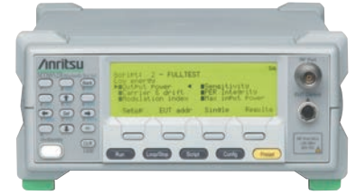
Bluetooth Test Set MT8852B